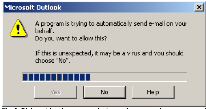
Fig. 2. Dialog asking the user to authorize another program's attempt to send e-mail using Outlook.

If the user responds affirmatively to this question (by first checking the box next to "Allow access" and then pushing the "Yes" button), the program is allowed to proceed. When the program attempts to send an e-mail, the dialog in Fig. 2 appears. The user must press "Yes" in order for the message to actually be sent.